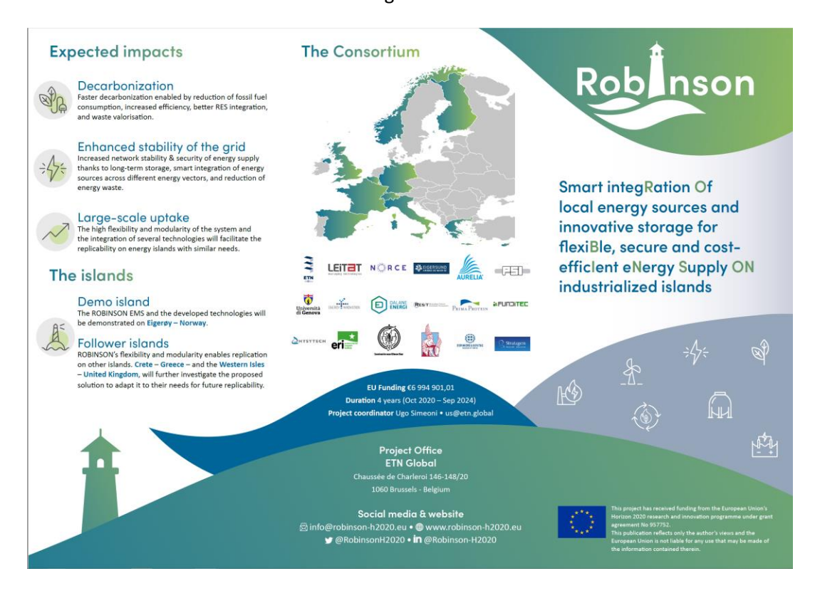
Figure 5: ROBINSON leaflet - front

the section <u>Results and publications > Dissemination Material</u>. A detailed explanation of the content of the leaflet and of its structure can be found in the report associated with D 7.3 "Public communication materials". Below the image of leaflet: