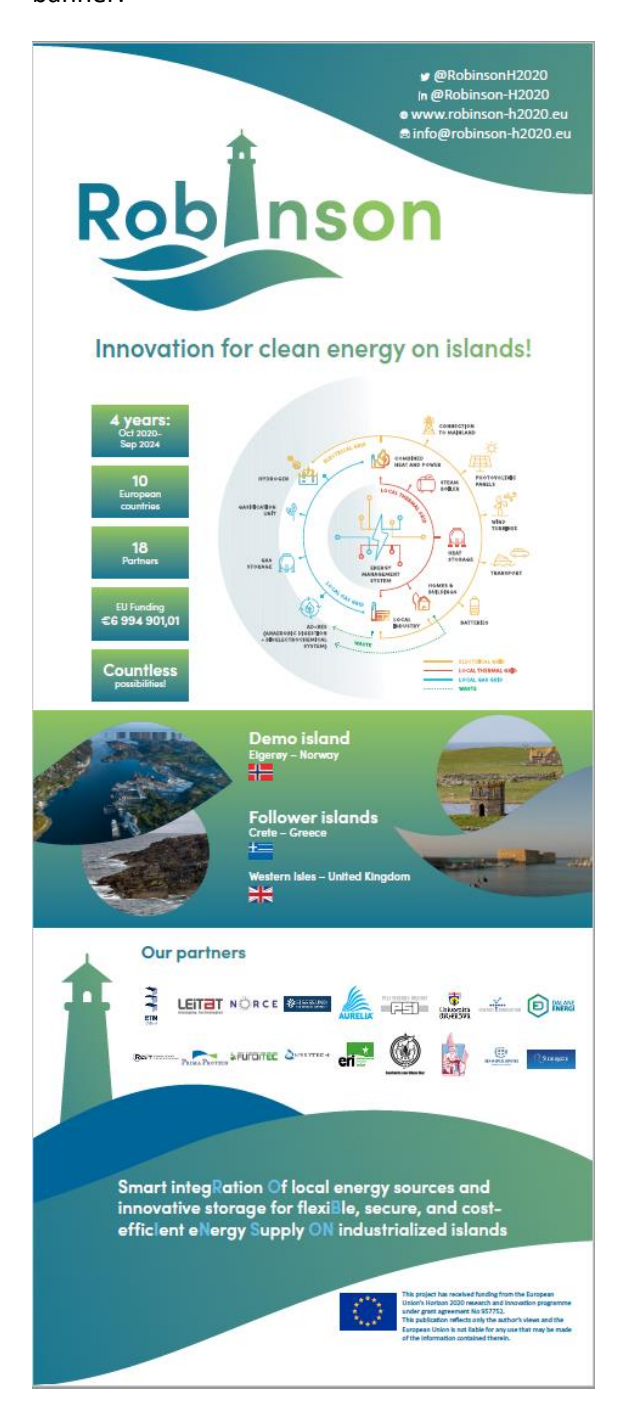
Figure 7: ROBINSON roll-up banner

A highly graphic roll-up banner (figure 7) has been developed to be displayed at public events, conferences and fairs. The roll-up banner features the key information about the ROBINSON project; its captivating design will draw people's attention to booths and stands where ROBINSON is featured, increasing altogether the dissemination of the project. The e-file of the roll-up banner will be available for download on the project's website under the section Results and publications > Dissemination Material. A detailed explanation of the content of the roll-up banner and of its structure can be found in the report associated with D 7.3 "Public communication materials". Below the image of the roll-up banner: