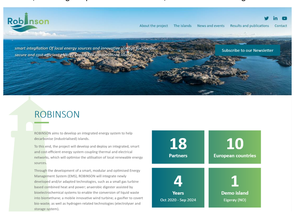
Figure 9:Header and top section of ROBINSON's homepage

The website, characterized by its user-friendly structure and accuracy of information, will remain up-to-date and include all relevant information. All the partners are requested to deliver relevant content for the website (in the English language) in a timely manner. The attractive design and the graphical elements, including the pictures of the islands, are a constant throughout the whole website.