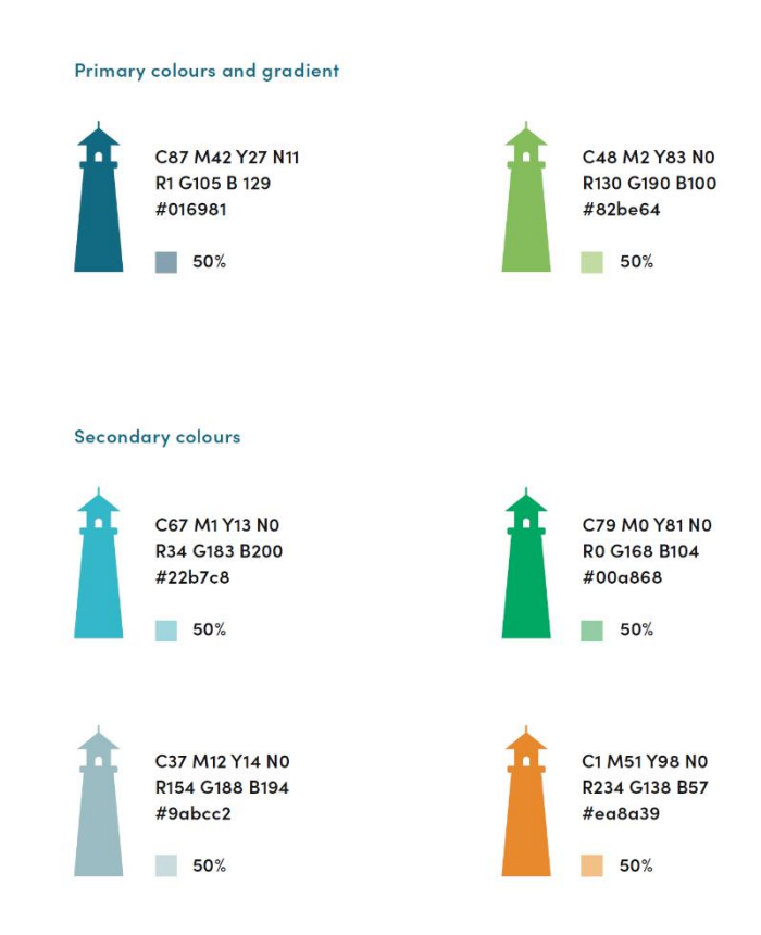
Figure 3: ROBINSON colours palette