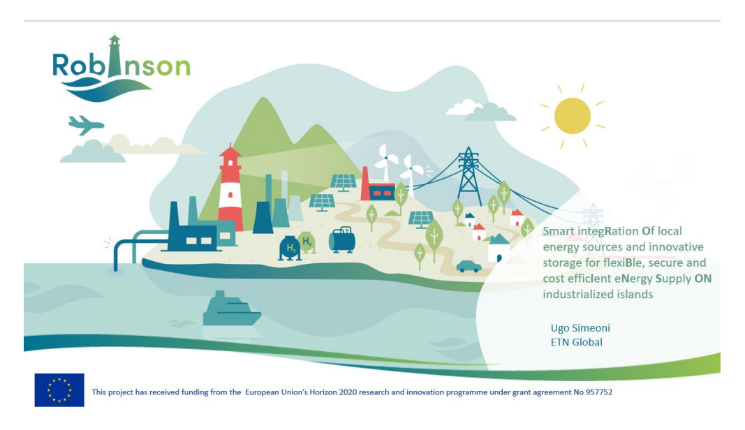
Figure 4: ROBINSON public presentation

The public presentation will be updated in the course of the project to include results and achievements. The public presentation will be downloadable on the website under the section <u>Results and publications > Dissemination Material</u>.