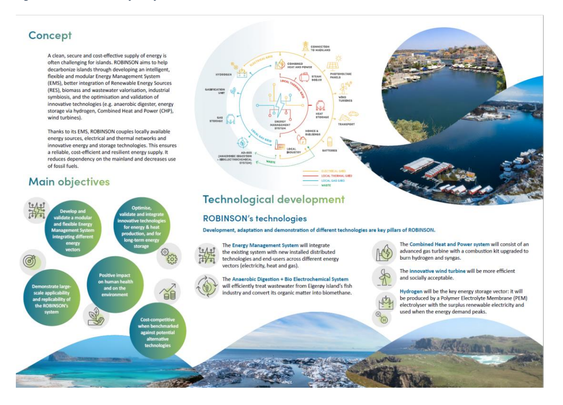
Figure 6: ROBINSON leaflet - back