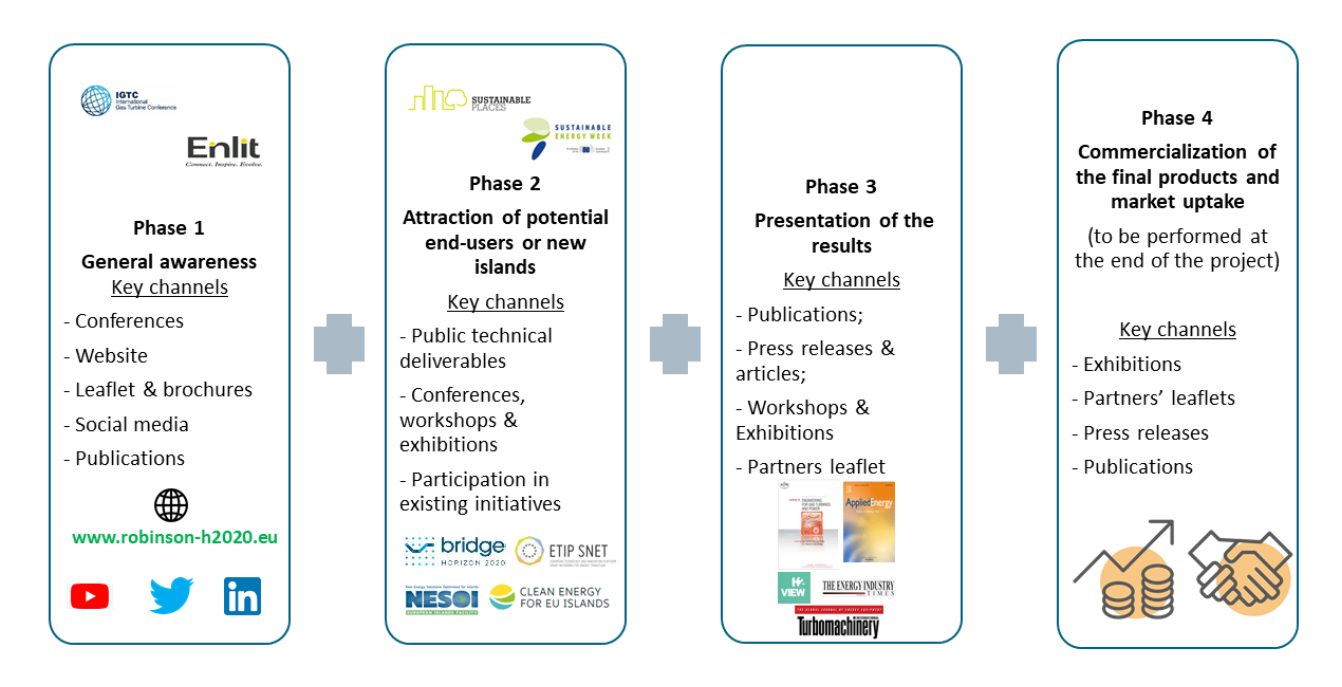
Figure 1: The four phases of ROBINSON's communication and dissemination strategy

Phase 1 – General awareness: Covers the first months of project implementation: creation of general awareness of the project existence based on the objectives and expected results.