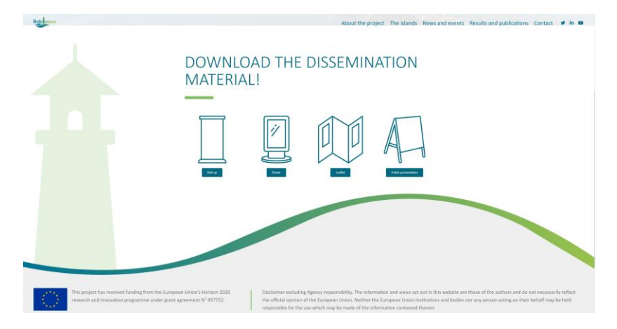
Figure 11: ROBINSON website: section with downloadable dissemination materials