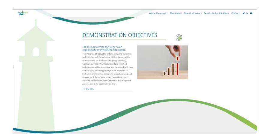
Figure 10: ROBINSON website: section objectives